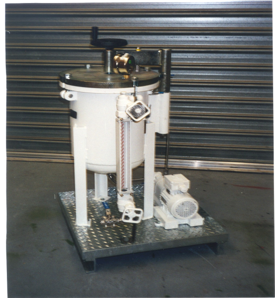
Fixed Collection Vessel

Fixed or removable vessel. Heat trace. Silconert treatment