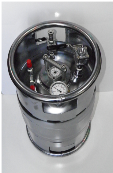
Portable Collection Vessel