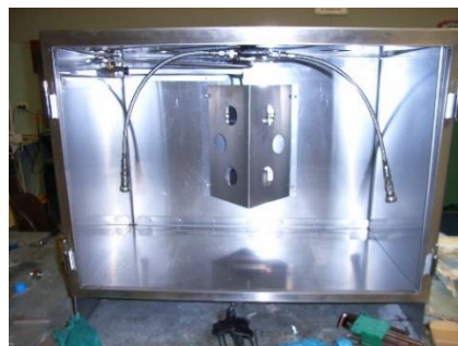
Stabilised crude oil sample collection enclosure for Swift Energy N.Z.