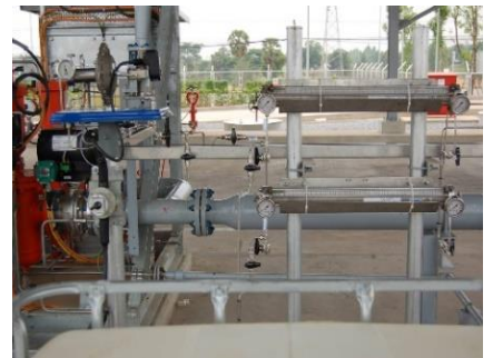
Condensate (unstabilised) sample collection skid Thailand