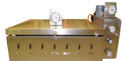
Heated sample cylinder enclosure. 6 cylinders IEC Ex Certified components