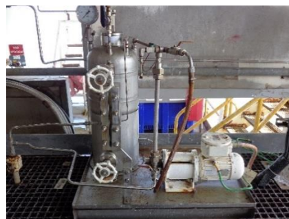
Stabilised crude oil collection skid - PNG