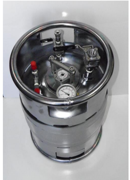
Portable Collection Vessel