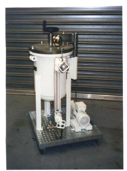
Fixed Collection Vessel