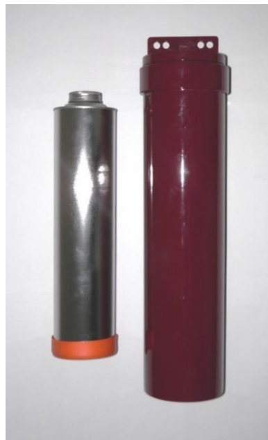
FC3.0 & Replaceable Cartridge

FC filter/dryers are ideally suited for combining in a dehydration assembly.